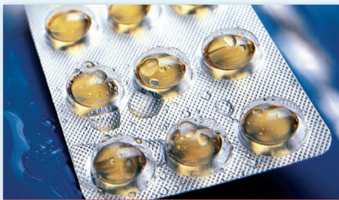
Blister packaging film made with TOPAS

With its remarkable property profile compared with known plastics, TOPAS COC offers new options for these applications.